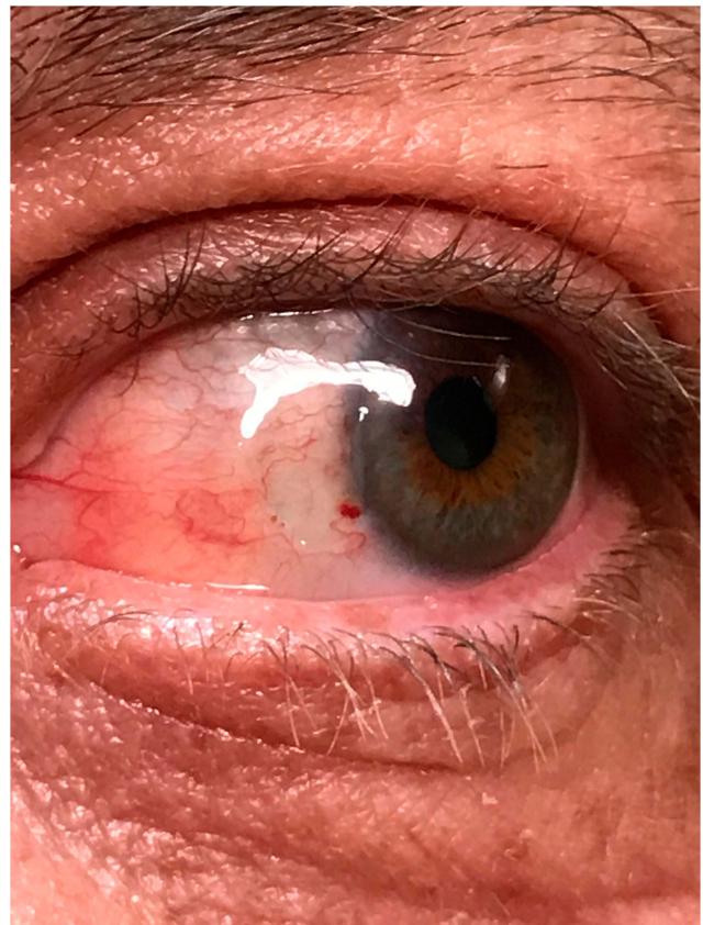
Figure 2 Example of a patient at post-operative day 30 results.

post-operative week 1, once the corneal epithelium was completely healed. In addition, topical loteprednol drops (Lotemax, Bausch and Lomb, Rochester, NY) were used 4 times daily for the first 2 weeks followed by a weekly taper thereafter. Patients remained on the loteprednol once a day until the conjunctival graft was quiet. Patients were seen for a post-operative visit at 1 day (Figure 1) and then within a week after surgery (when the bandage lens was removed) and then at 1 month (Figure 2). Eyes were examined again at least 6 months post-operatively for signs of recurrence or complications and then annually for several years when patients kept their follow-up. All results were recorded.