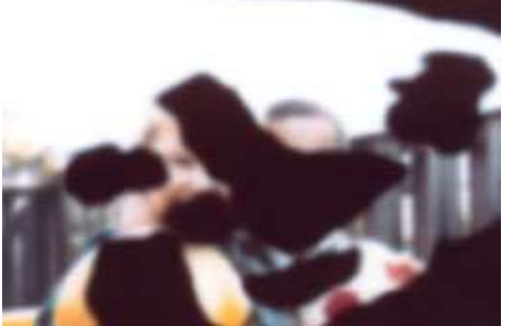
Vision impaired by Diabetic Retinopathy