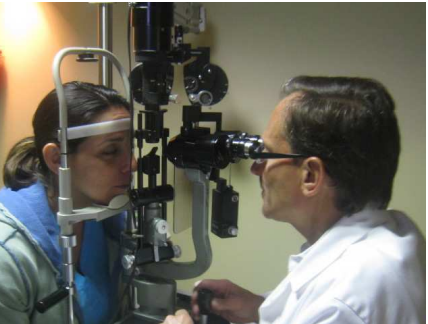
Examining a patient...